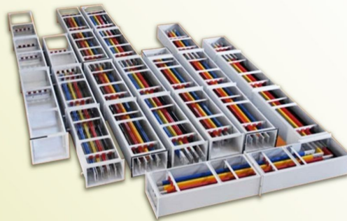
Bus Duct Panel