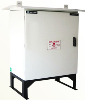
Feeder Pillar Panel