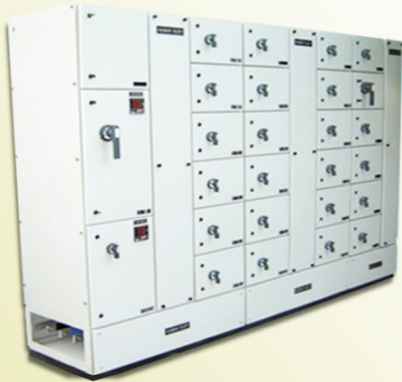
Lighting Distribution Panel (LDP)