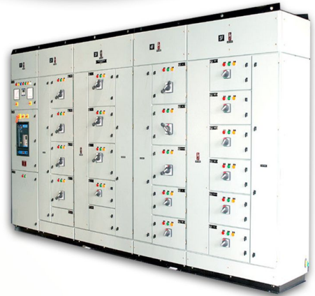
Power Distribution Panel (PDP)